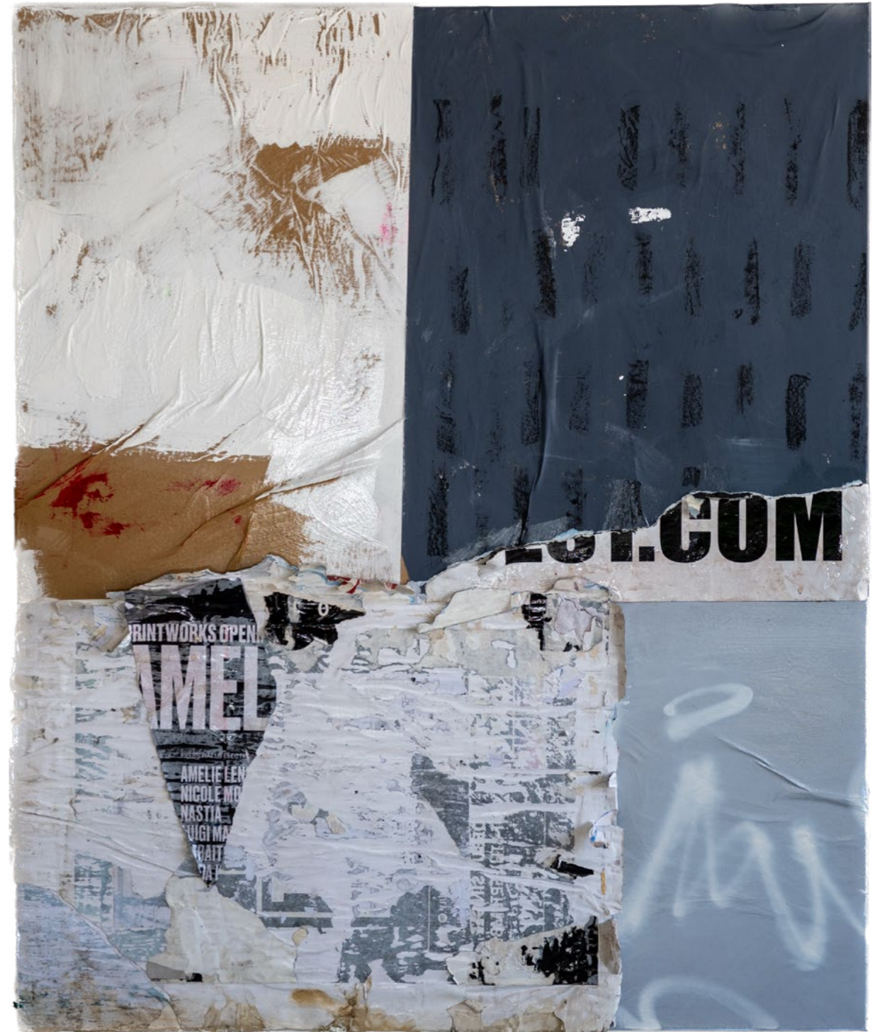
STRANGER IN THE ROOM 2023

Oil, acrylic, spray paint, paper on canvas 100cm x 120cm