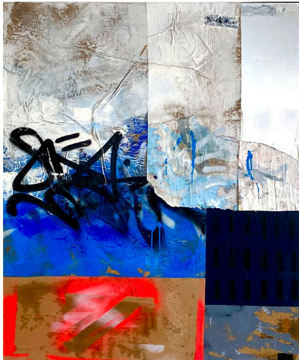
REFLECTED: REFLECTION 2023

The light, the joy, the fear, the pain, the movement, reverberate across his canvas, its sheer joy.