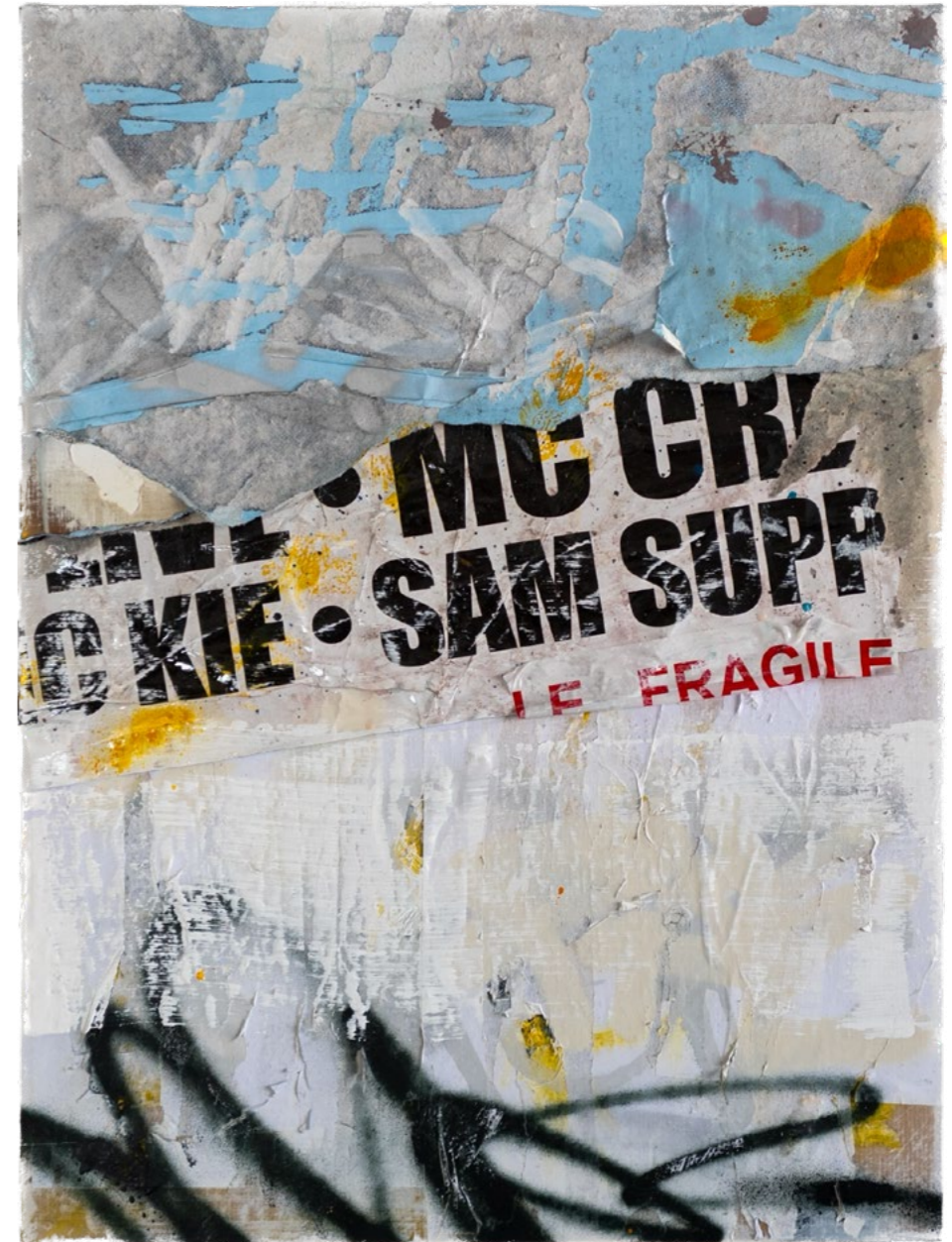
THE UNKNOWN 2023

Oil, acrylic, spray paint, paper on wood 45cm x 60cm