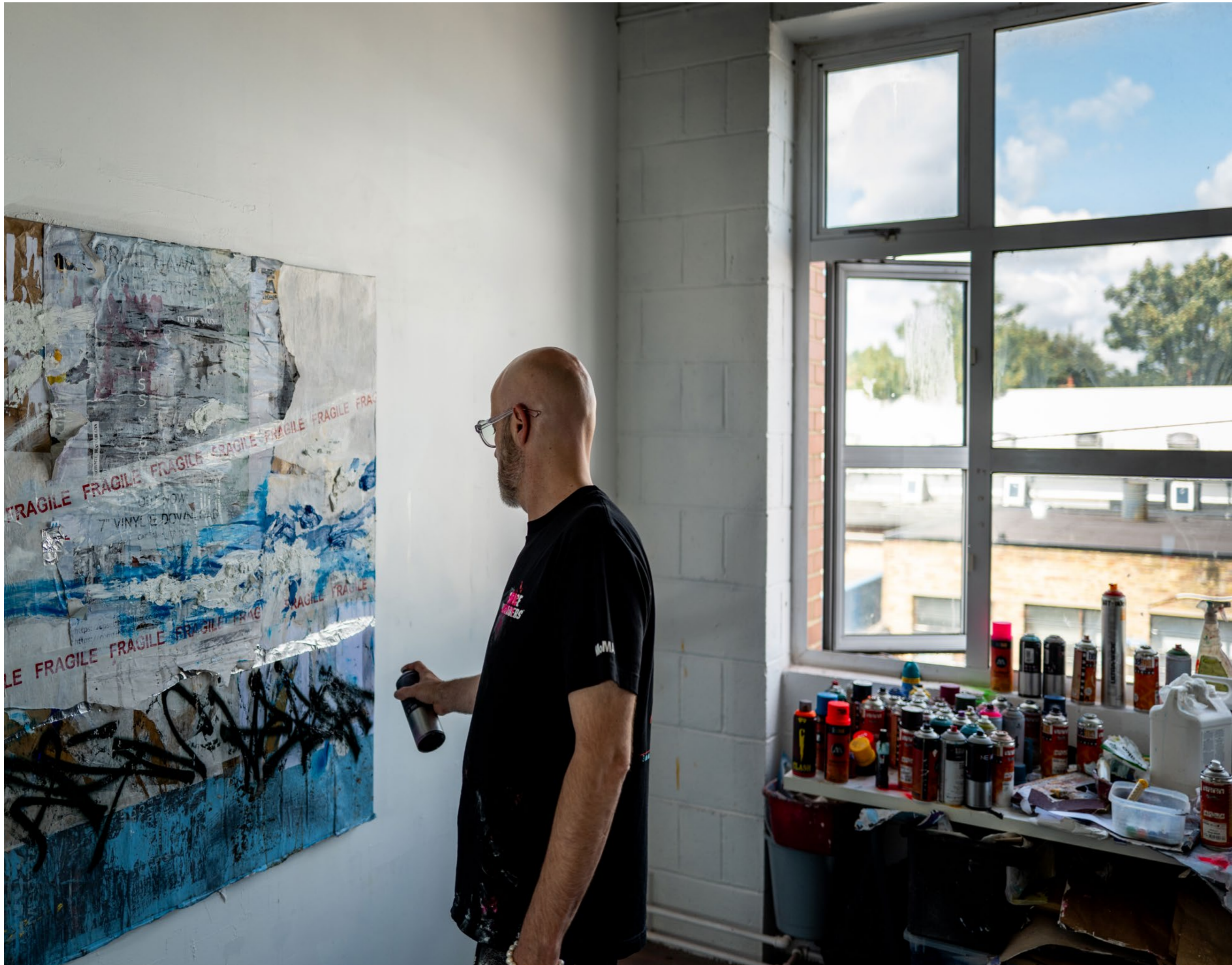
In the studio LIMIT TO YOUR LOVE 2023

Oil, acrylic, spray paint, paper on canvas 100cm x 120cm