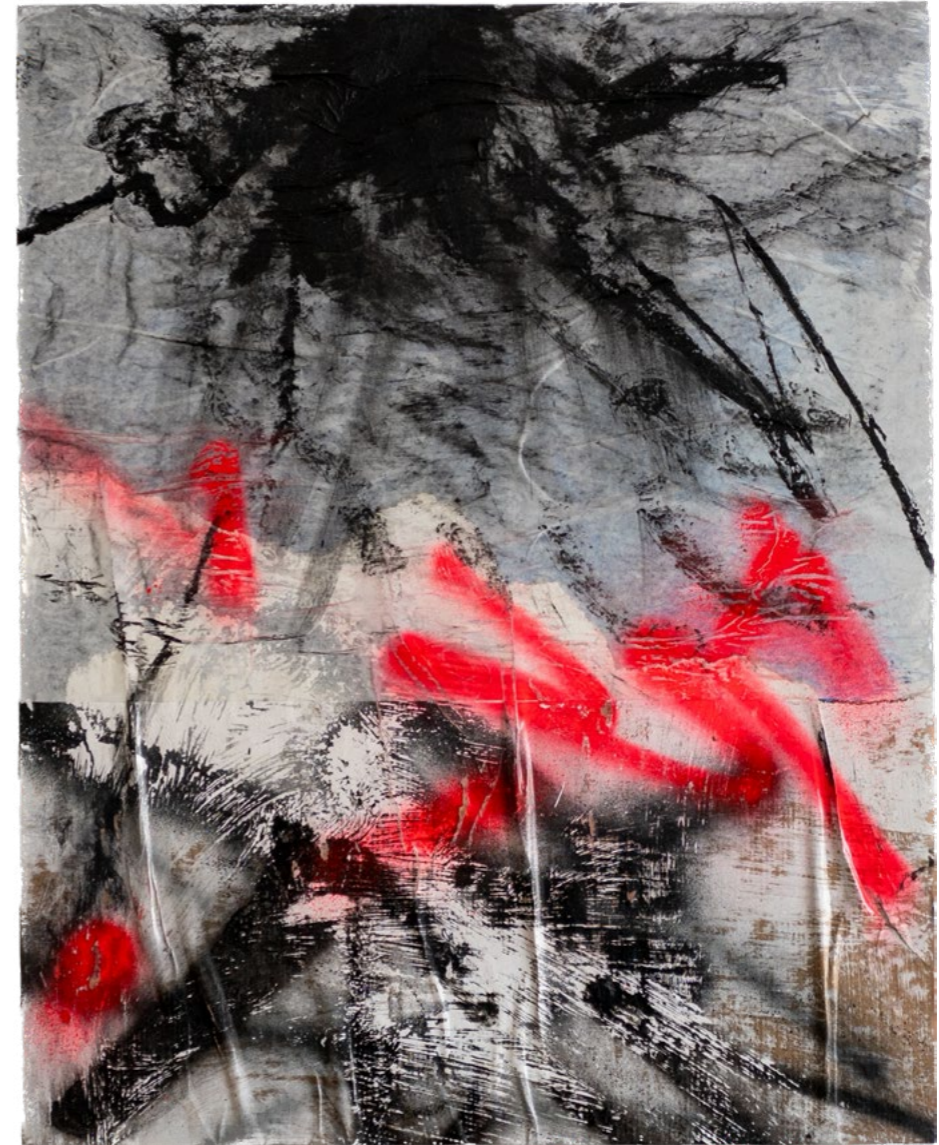
INTO THE DISTANCE 2023

Oil, acrylic, spray paint, paper on wood 40cm x 50cm