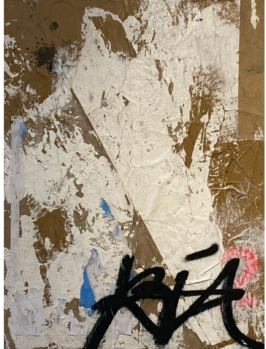
VALE ROAD 2023

The city is way more vivid when you speak to it.