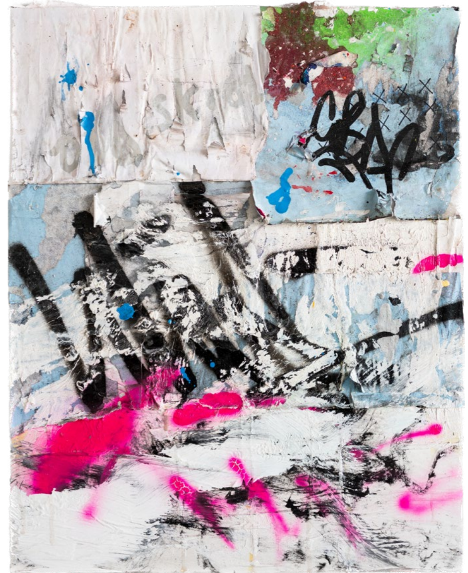
BETWEEN THE WAVES 2023

The grit of the street, all the visual sounds.