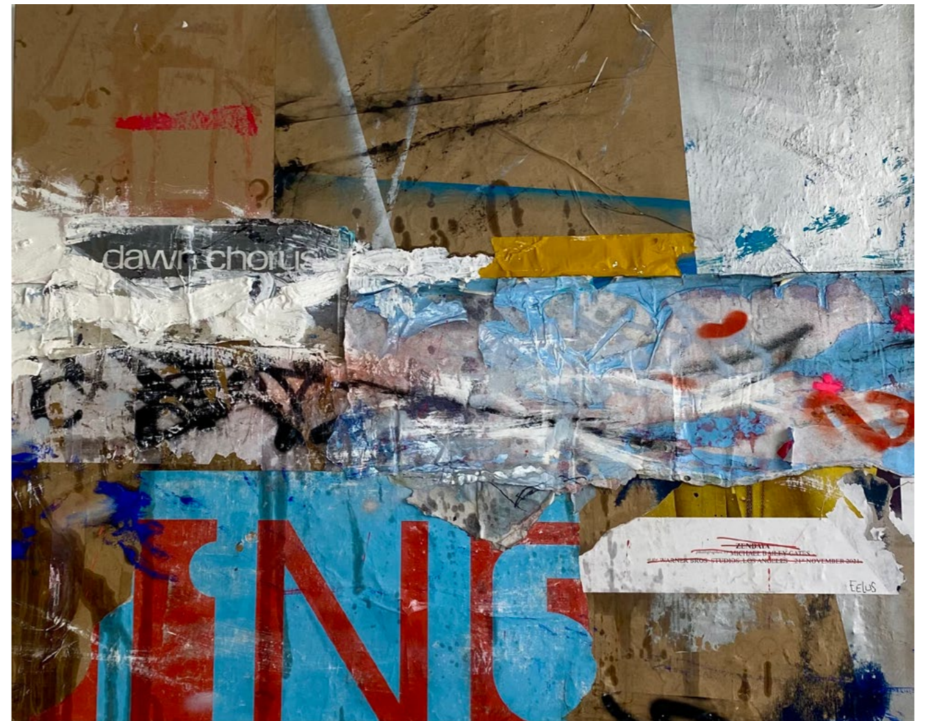
HOLD ME UNTIL DAY BREAK 2023

Creating layers, subtracting layers, is what happens in my process.