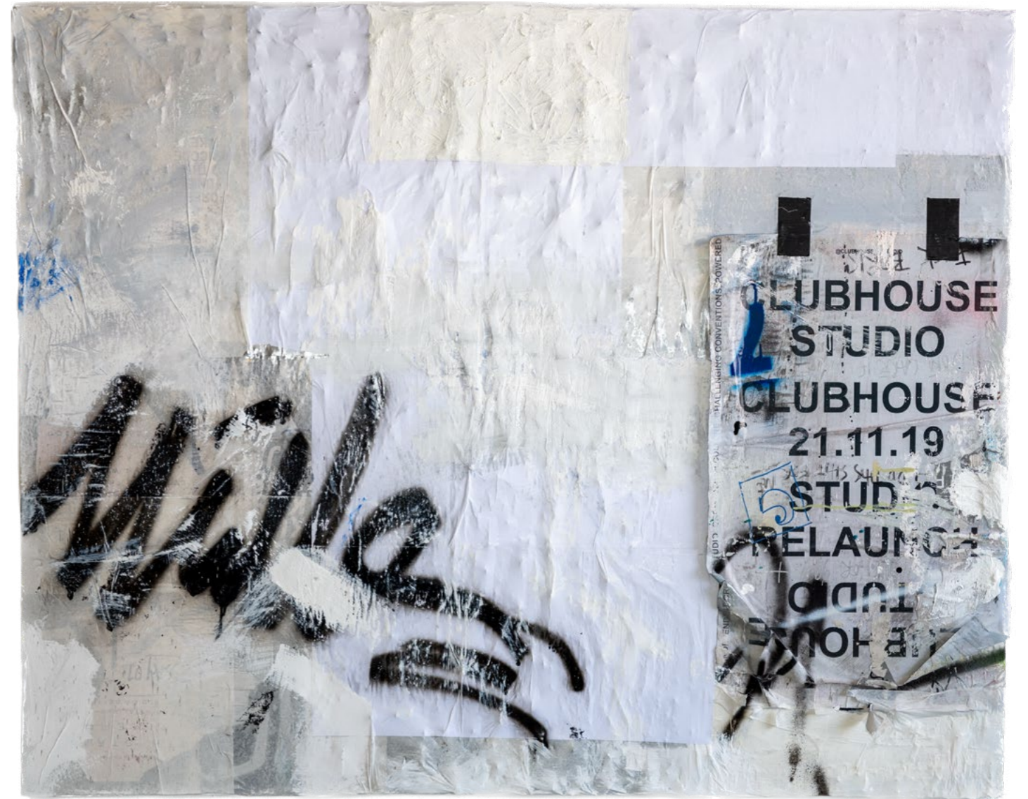
THINKING OF YOU 2023

this is physical, yet powerful, colourful and engaging.