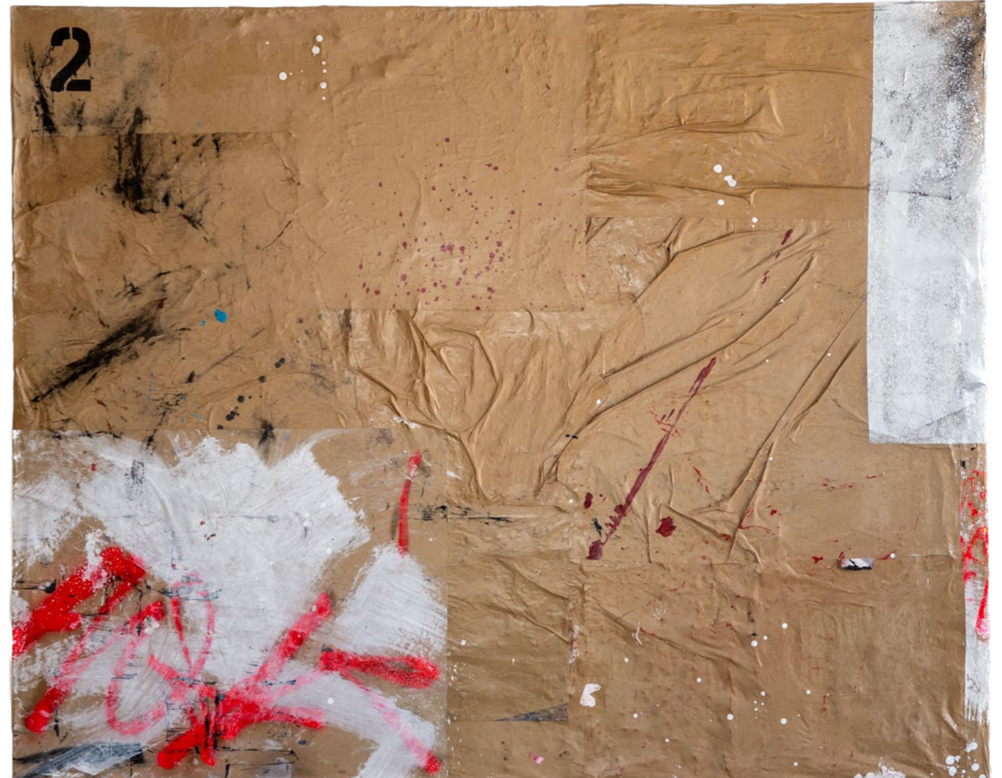
STAY WITH ME 2023

I'd like to say beautiful things but I dont know how to.