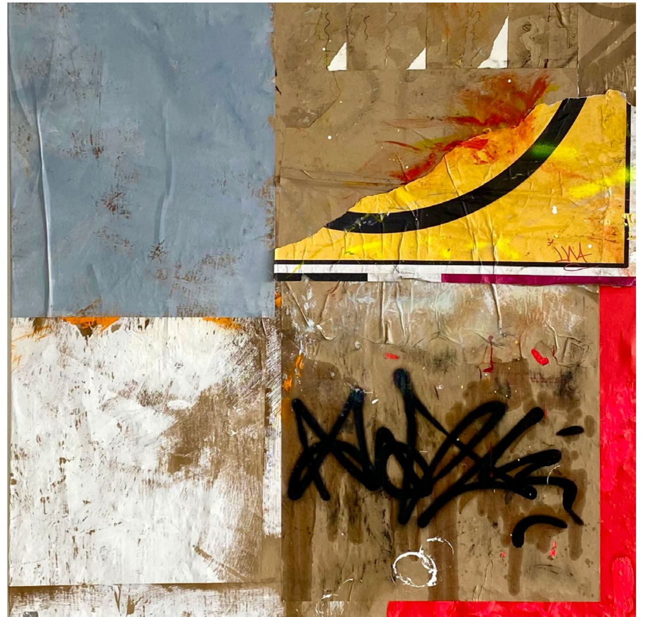
SECRETS AND LIES 2023

I just paint to celebrate the other side of beautiful, the has beens the imperfection, the decay.