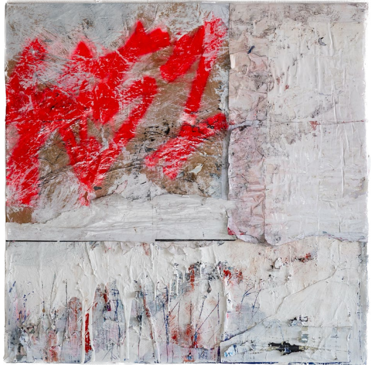
THE JOURNEY 2023

This is absolutely the most fascinating time we could possibly have hoped to be alive in so whatever you do dont take it for granted